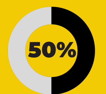
of Black girls report someone in school pulling at their clothing in a sexual way.<sup>8</sup>