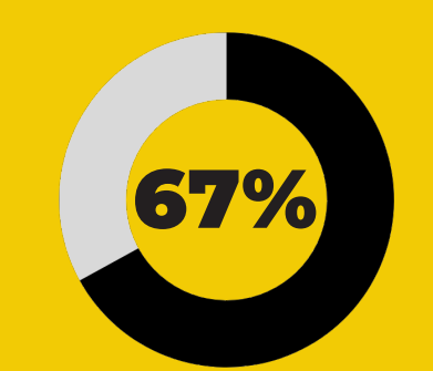
of Black girls report having been "touched, grabbed, or pinched in a sexual way" by someone in school.<sup>7</sup>